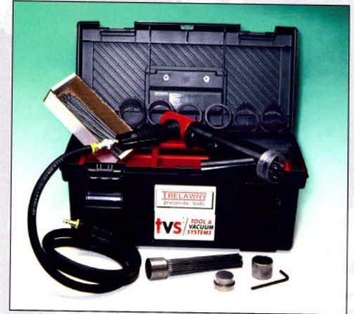
SHROUDED PISTOL GRIP SCALER KIT 2B/PG – 139.2100 3B/PG – 139.3100