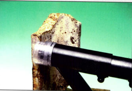
Edge Wear Cuff