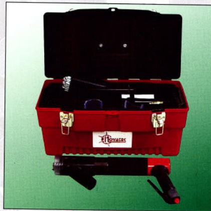
SHROUDED VL303 "LOW VIBRATION" SCALER KIT 139.3099