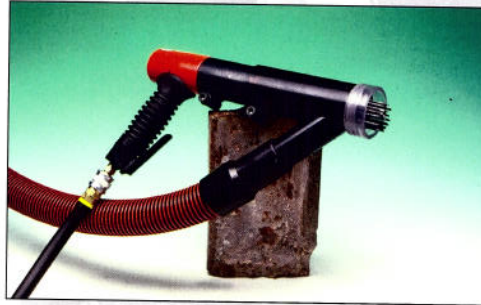
SHROUDED PISTOL GRIP SCALER 2B/PG – 139.2107 3B/PG – 139.3107