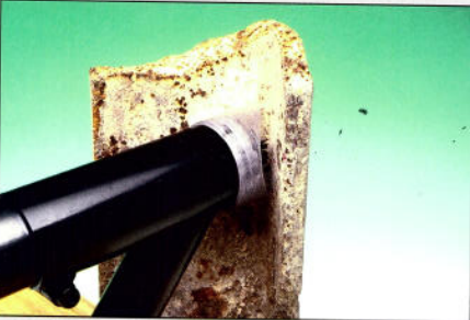
Corner Wear Cuff